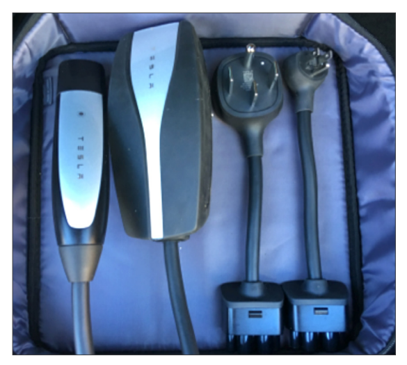
FIGURE 2: Example of Level 1 EVSE. Some EVs are sold with a Level 1 EVSE that can use either 240V or 120V.

The advantage of Level 2 EVSE is twoway communication that allows the co-op (or a third party) to control charging and collect charging data.