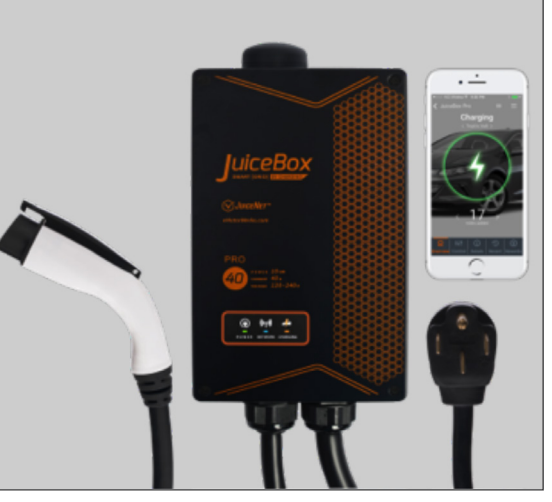
FIGURE 3: Example of Level 2 EVSE and phone app.

no insight into the charge behavior. The second, more expensive, but more controllable type of charging uses Level 2 EVSE, which deliver up to 80 amps, provides 10 to 60 miles of charge per hour, and can communicate with both the member and the co-op (see Figure 3). Level 2 EVSE cost about $500 to $1,000, and depending on any necessary service and wiring upgrades, can cost a few hundred to one or two thousand dollars for installation by an electrician (Dayem et al. 2018). The advantage of Level 2 EVSE is two-way communication that allows the co-op (or a third party) to control charging and collect charging data. Without Level 2 EVSE, the co-op cannot directly control charging, and must rely on members to charge during beneficial times.<sup>4</sup>