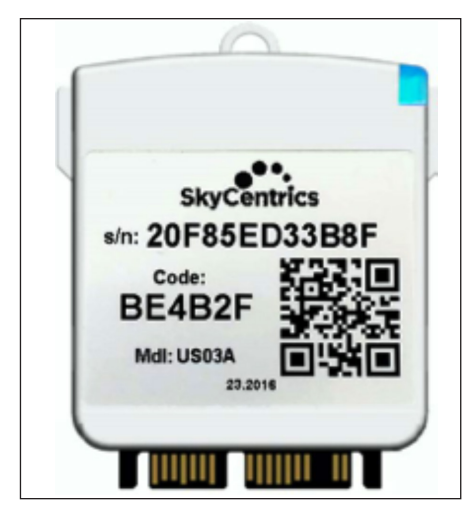
Figure 3: DC Form Factor Communications Module. Photo courtesy of SkyCentrics

Figure 1: Illustration of CTA-2045 Port on a Water Heater, and a CTA-2045 AC Form Factor Communications Module. Figure modified from EPRI