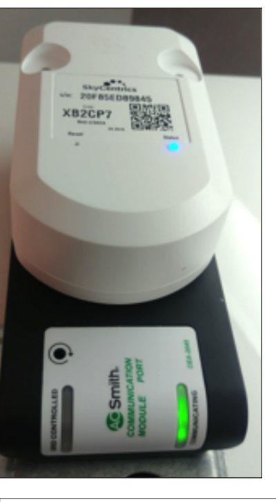
Figure 2: Photo of SkyCentrics AC Communications Module Connected to an A.O. Smith Water Heater.

The standard hardware interface means modules can be installed "plug & play" into a port built into a device, simplifying the installation process. The communications module enables a connection to the utility's DR systems and allows for the use of a variety of popular technologies. Co-ops are free to select those that fit their unique circumstances. For example, technologies such as Ethernet, Wi-Fi, and Zigbee rely on the consumer's Internet connection, while cellular and power-line-carrier communications do not. Any necessary communications module and end product software updates can be made remotely from the utility, vendor, or manufacturer head-end. When a type of communications hardware