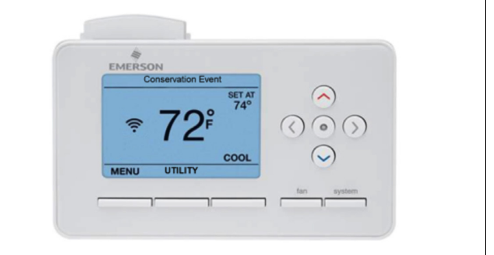
Figure 4: DC Communications Module Plugged into the Upper Left Corner of an Emerson Smart Thermostat.

becomes obsolete, the communications module can be swapped out, avoiding obsolescence of the entire product.