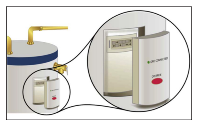
Figure 1: Illustration of CTA-2045 Port on a Water Heater, and a CTA-2045 AC Form Factor Communications Module. Figure modified from EPRI