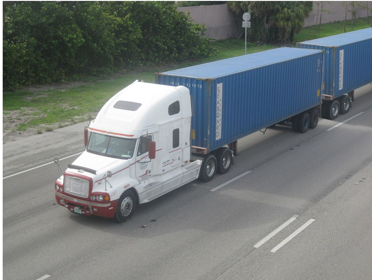
Example: Truck pulling two trailers and shipments