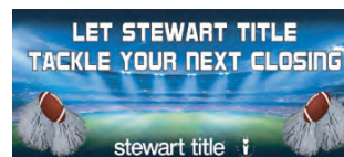
Our 2' x 6' booth horizontal banner can hang on the back of your booth. Single-sided with grommets for hanging. Banner material is heavy duty 13oz. Can be reused over and over. $95.00