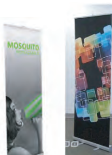
Retractable Banner Stand Can be used over and over. Easy set-up. Graphics included in price. 32" x 82" Includes Carrying Case $185.00