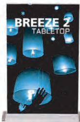
Retractable Mini table top Banner Stand Can be used over and over. Easy set-up. Graphics included in price. 11" x 17" $36.00

ALL CANCELLATIONS FOR ITEMS ORDERED MUST BE MADE 5 BUSINESS DAYS BEFORE THE EXHIBITOR MOVE IN DATE TO RECEIVE A FULL REFUND. ITEMS CANCELLED AFTER THE 3 BUSINESS DAYS BUT BEFORE THE EXHIBITOR MOVE IN DATE WILL BE SUBJECT TO A RESTOCKING FEE OF $25.00. ANY ITEMS DELIVERED TO THE SHOW SITE OR ITEMS REQUESTED TO BE REMOVED BY THE SHOW REPRESENTATIVE FOR ANY REASON WITHOUT PRIOR CANCELLATION WILL BE CHARGED AT FULL PRICE EVEN IF REFUSED AT BOOTH.