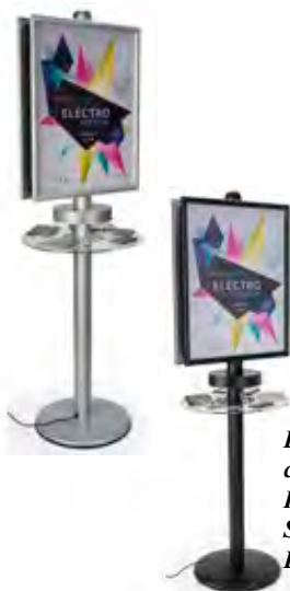
Double sided or single sided charging stations. RENTAL In black or silver. Single $360.00 Double $395.00